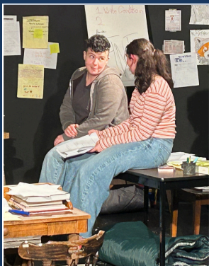
Production Photos from 2024 Directors Lab